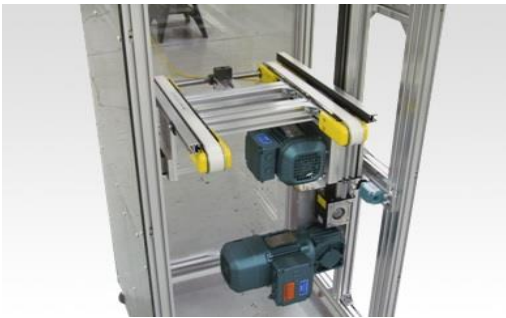
Electric Elevator/Lowerator w/ Dual Lane Timing Belt