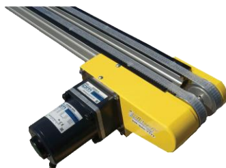
Timing Belt Conveyor

You probably already know that Direct Conveyors is a leading manufacturer of low profile conveyors in the industry and at a very competitive price point. These include conveyors such as flat belt, timing belt and chain drive.