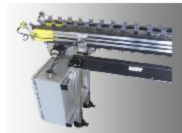
Fixtured Chain Drive Conveyor

Providing both standard and custom designed conveyance solutions, they can improve your productivity and efficiency to lower your operating cost. Now let's take a closer look at some of the more unique types of conveyors they can produce - demonstrating their focus and dedication to their customers' needs.