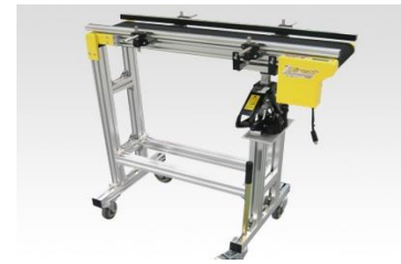
Pivoting Flat Belt Conveyor w/ Manual Hydraulic Height Adjustment

Direct Conveyors wants to be your conveyor provider. Please visit their website at: www.directconveyors.com to learn much more about their products, view both 3D and 2D drawings or watch a variety of videos highlighting their equipment.