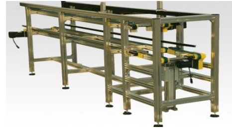
Tray Handling System w/ Pneumatic Elevator/Lowerator