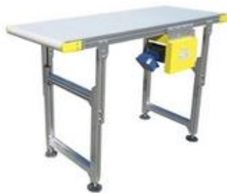
Flat Belt Conveyor