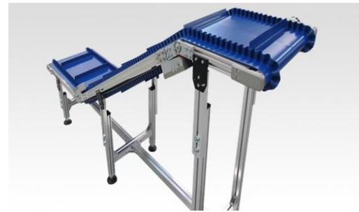
48 Series Flat Belt "Z" Conveyor