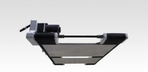
Dual Lane Magnetic Conveyor