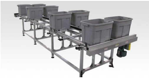
Dual Lane Tote Handling System