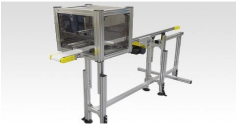
Vision Inspection Conveyor