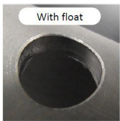
Before burr removal