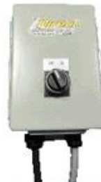
Fixed Speed Capacitor Box w on/off Switch