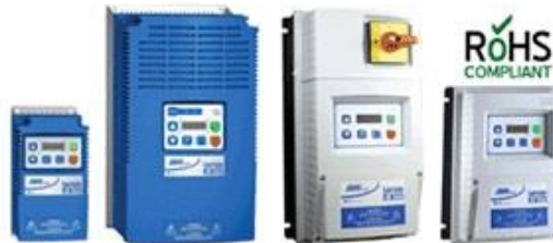
Nema - 1 & Nema - 4X Variable Frequency Drives