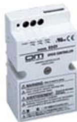
Panel Mount Controller