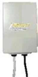
Fixed Speed Capacitor Box