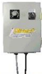
Variable Speed Nema-12 Box

Variable speed controllers available for din rail mount or in Nema-12 box. Enclosed controllers for harsh environments (Nema-12 or Nema-4x) fix speed motors with on/off switches as an option control cords with quick disconnects as a standard.